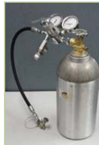
#171-31 High-Pressure Nitrogen Assembly